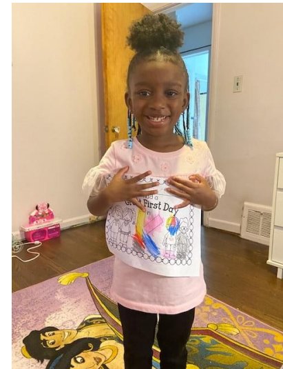
Journey Kindergartener at UPAD Elementary